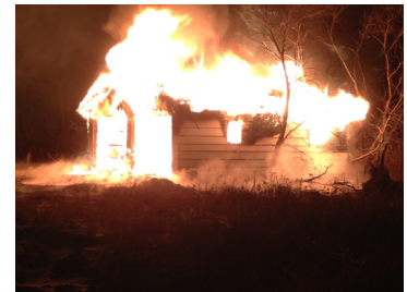
Winkler Fire Department Call Distribution by Area

There was 1 less mutual aid call outside our immediate response areas from the previous year