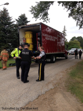
Submitted by Garl Busckert

As illustrated on the graph above the numbers of fire incidents, CO incidents, Technical Rescue, Wildfire incidents, and HazMat incidents rose in 2014 as compared to 2013. Motor Vehicle Accidents and false alarms decreased in 2014 from 2013.