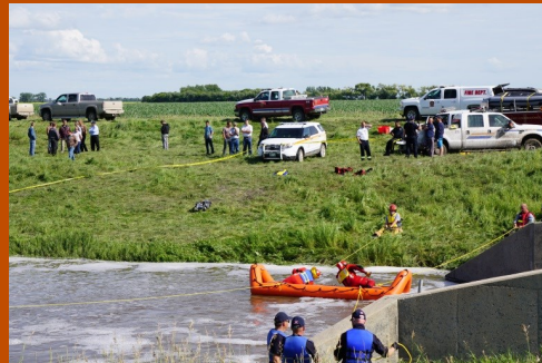
July 2016 Water Rescue incident