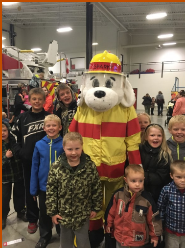
Sparky & Kids at the FPW Open House

CO-OP PETER NEUFELD CONSULTING LITTLE MORDEN SERVICE WINKLER CANVAS LOADLINE MANUFACTURING MSTW FRIESEN INSURANCE TIMBILT BUILDINGS PROTEC PLUMBING & HEATING BORDERVIEW ELECTRIC SOUTHERN POTATO HARVAL HOMES GENERAL METAL LEATHERDALE INSURANCE SPENST BROTHERS EVIRO TECH POWDER COATING GATEWAY RESOURCES CITY OF WINKLER