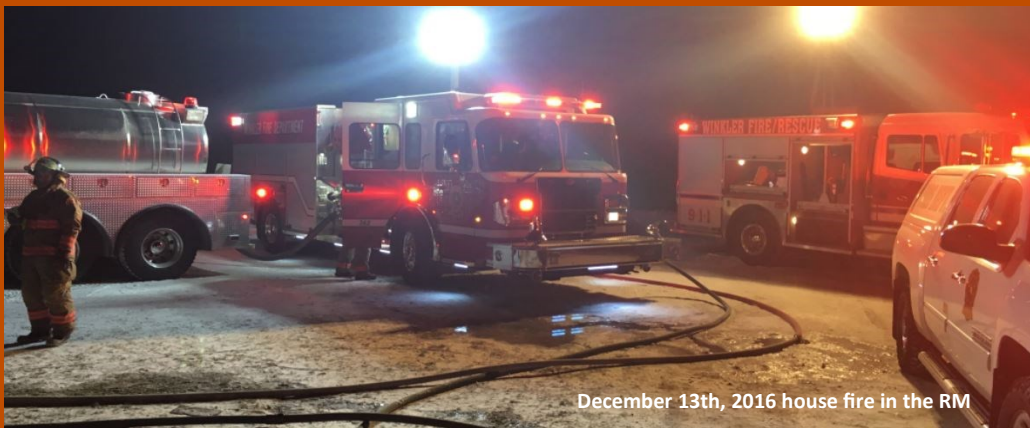
December 13th, 2016 house fire in the RM