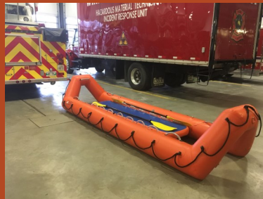
Polar 75 used for low-head dam rescue purchased with donation from Enbridge