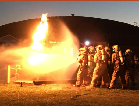
Propane tank prop in action. Construction made possible with donation from Enbridge

CO-OP PETER NEUFELD CONSULTING LITTLE MORDEN SERVICE WINKLER CANVAS LOADLINE MANUFACTURING MSTW FRIESEN INSURANCE TIMBILT BUILDINGS PROTEC PLUMBING & HEATING OPULENT SPAS SOUTHERN POTATO HARVAL HOMES GENERAL METAL LODEKING SPENST BROTHERS EVIRO TECH POWDER COATING GATEWAY RESOURCES CITY OF WINKLER STAPLES ELITE HOME IMPROVEMENTS